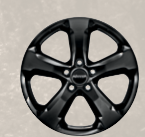
20-inch Gloss Black-painted aluminum (Available on Altitude Package and Altitude X)