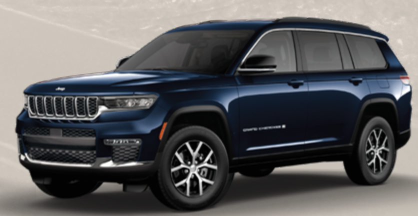
3-Row Limited in Midnight Sky