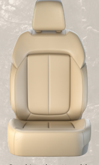
Capri Leatherette with Wicker Beige (Standard)