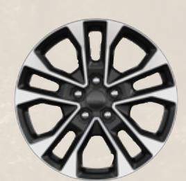
20-inch machined-face aluminum with Black Noise-painted pockets (Standard)