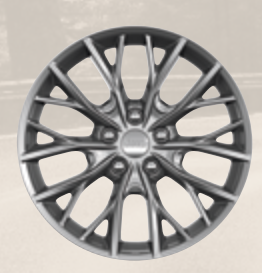
20-inch Silver Lithos fully painted aluminum (Standard)