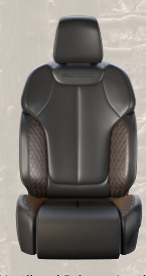
Ventilated Palermo Leather with Quilted Palermo Leather Bolsters and Cognac accent stitching, Steel Gray piping and embossed Summit logo — Global Black (Standard with Summit Reserve Group)