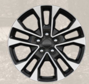
20-inch machined-face aluminum with Black Noise-painted pockets (Standard)