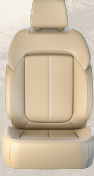
Capri Leatherette with Light Tungsten accent stitching — Global Black / Wicker Beige (Standard)