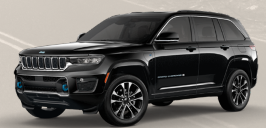
Overland® 4xe in Diamond Black Crystal Pearl