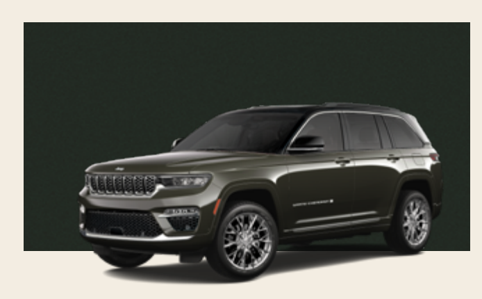
Rocky Mountain Pearl