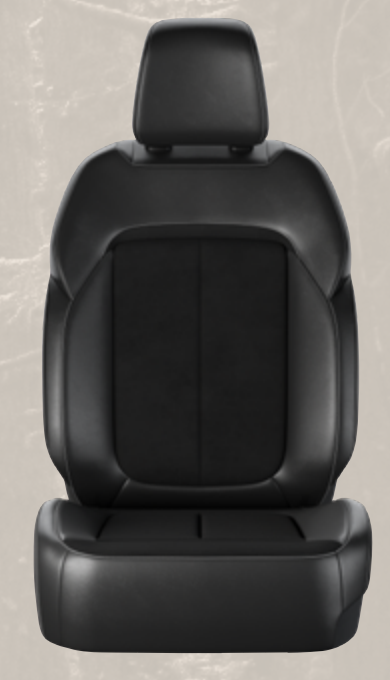
Capri Leatherette and Perforated Suede with Light Tungsten accent stitching -Global Black (Standard with Altitude X and Altitude Package)