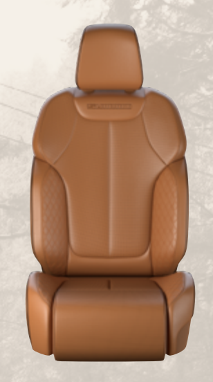
Ventilated Nappa Leather with Quilted Nappa Leather Bolsters and Cognac accent stitching, Global Black piping and embossed Summit logo — Tupelo/Black (Standard)