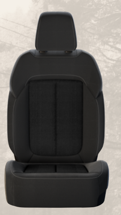
Origin and Essence Cloth with Light Tungsten accent stitching — Global Black (Standard)