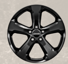
20-inch Gloss Black-painted aluminum (Standard with Black Appearance Package)