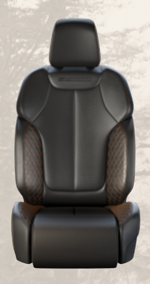
Ventilated Nappa Leather with Quilted Nappa Leather Bolsters and Cognac accent stitching, Steel Gray piping and embossed Summit logo — Global Black (Standard)