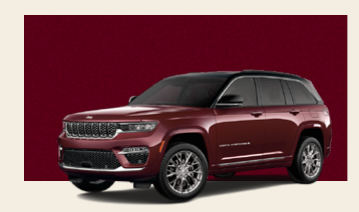
Velvet Red Pearl