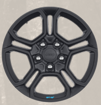
18-inch Granite Crystal fully painted aluminum (Standard)