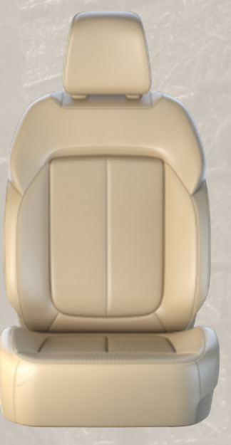
Ventilated Capri Leatherette and Axis II Perforations with Light Tungsten accent stitching — Global Black / Wicker Beige (Standard with Luxury Tech Group II)