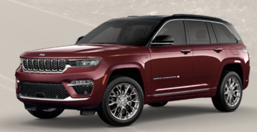
Summit 4xe in Velvet Red Pearl