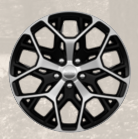
21-inch machined-face / Gloss Black-painted aluminum (Standard with Summit Reserve Group)