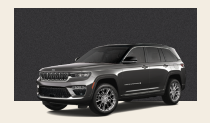
Baltic Gray Metallic