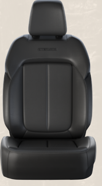
Ventilated Nappa Leather and Axis II Perforations with Light Tungsten accent stitching, Diesel Gray piping and embossed Overland logo — Global Black (Standard)