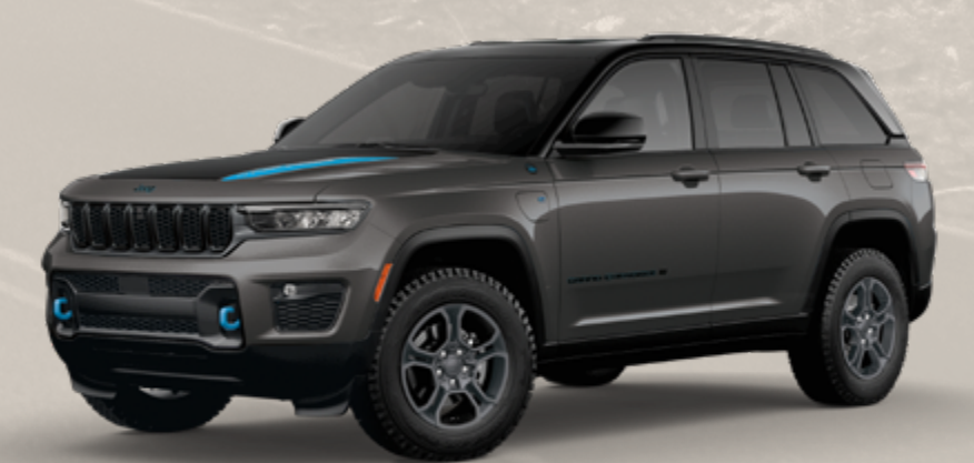
Trailhawk 4xe in Baltic Gray Metallic