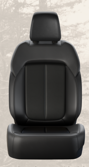
Capri Leatherette with Light Tungsten accent stitching — Global Black (Standard)