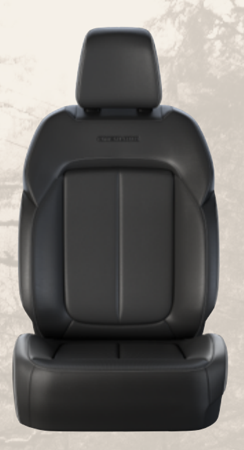
Ventilated Nappa Leather and Axis II Perforations with Light Tungsten accent stitching, Diesel Gray piping and embossed Overland logo — Global Black (Standard)