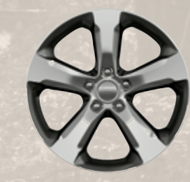
20-inch Technical Gray-painted machined aluminum (Available)