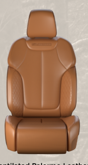
Ventilated Palermo Leather with Quilted Palermo Leather Bolsters and Cognac accent stitching, Global Black piping and embossed Summit logo — Tupelo / Black (Standard with Summit Reserve Group)