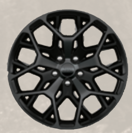
21-inch Black Noise-painted aluminum (Standard with High Altitude Package)