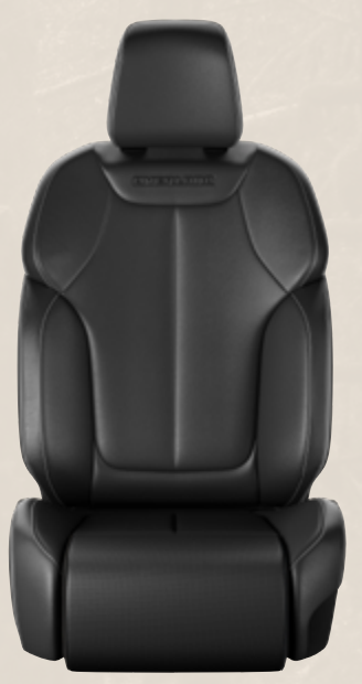
Ventilated Nappa Leather and Axis II Perforations with Light Tungsten accent stitching, Diesel Gray piping and embossed Overland logo — Global Black (Standard with Luxury Tech Group IV)