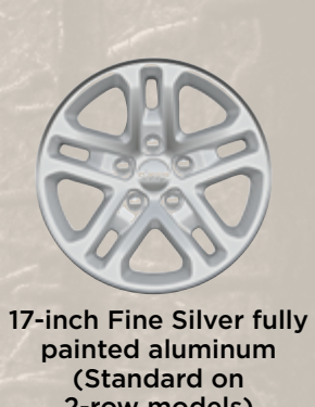
painted aluminum 2-row models)