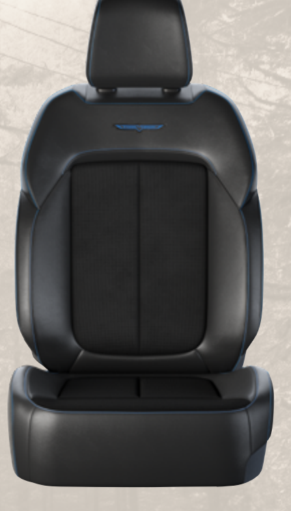
Ventilated Capri Leather and Axis II Perforated Suede with Surf Blue accent stitching — Global Black (Standard)