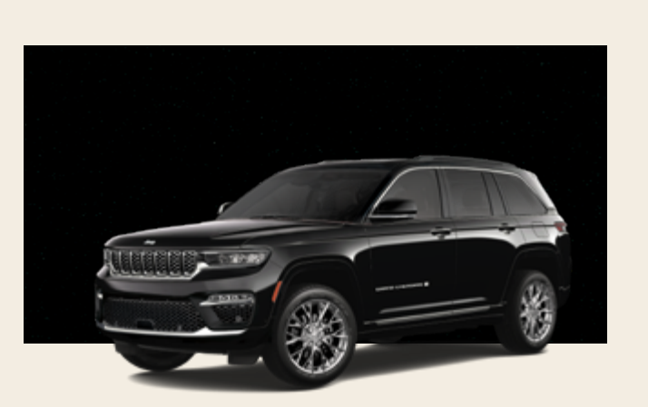
Diamond Black Crystal Pearl