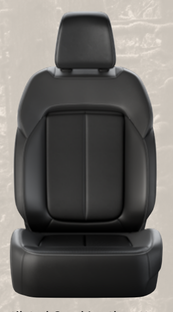
Ventilated Capri Leatherette and Axis II Perforations with Light Tungsten accent stitching — Global Black (Standard with Luxury Tech Group II)