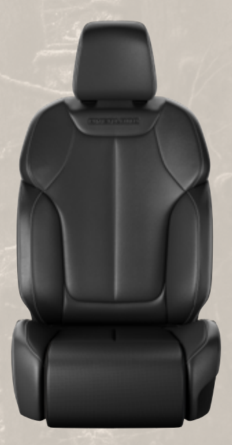
Ventilated Nappa Leather and Axis II Perforations with Light Tungsten accent stitching, Diesel Gray piping and embossed Overland logo — Global Black (Standard with Luxury Tech Group IV)