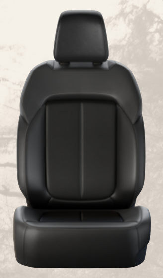
Capri Leatherette with Light Tungsten accent Light Tungsten accent stitching — Global Black stitching — Global Black / (Standard)